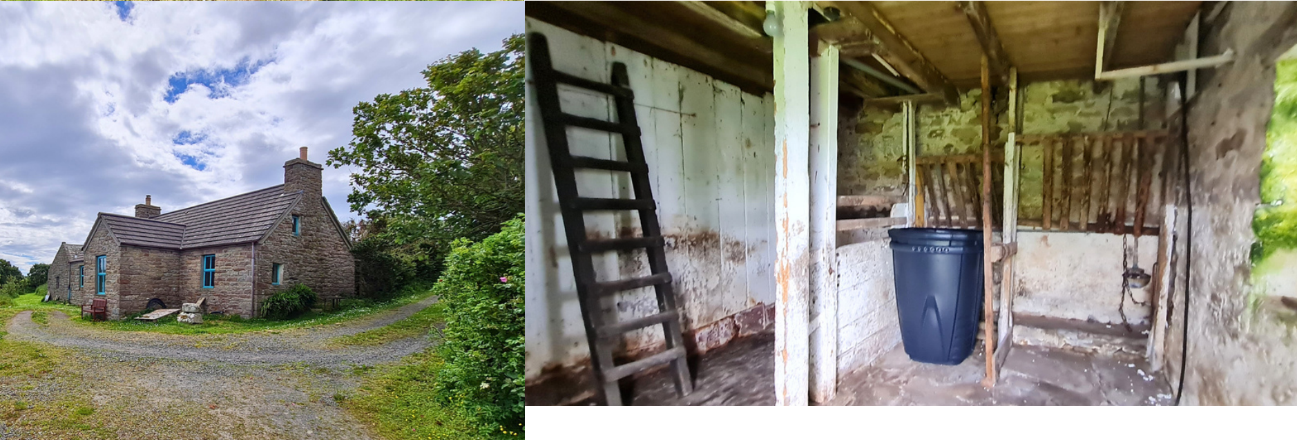
Outbuilding 2 4.03m x 3.50m (13ft 2" x 11ft 5") With lighting.